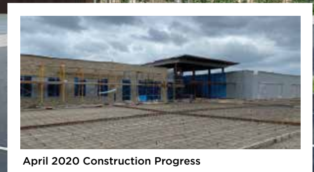
April 2020 Construction Progress