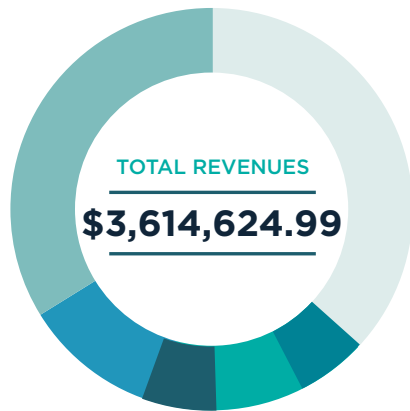
2018-2019 FUNDING SOURCES