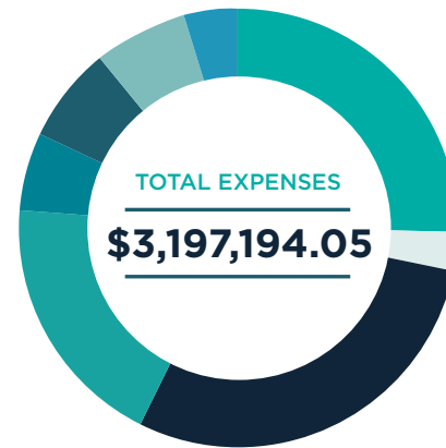
2018-2019 OPERATING EXPENSES