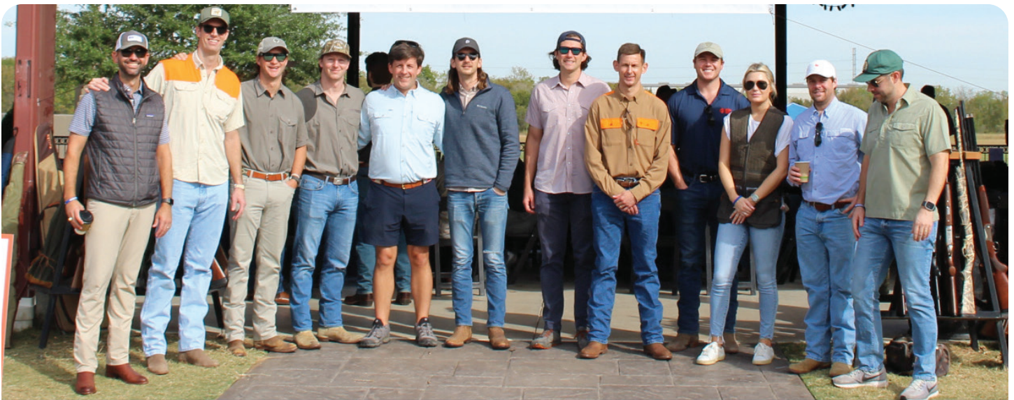
Special Thanks to Members of the Host Committee